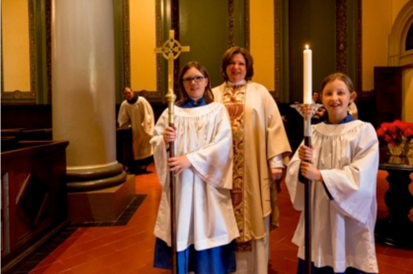
From Easter 2017